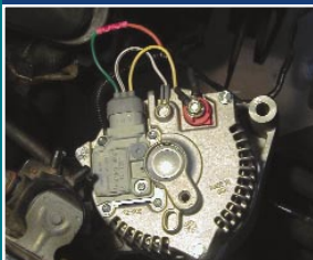
Steps 12-14 Picture 2